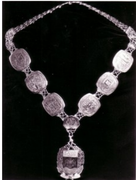
Chain of Office 1979